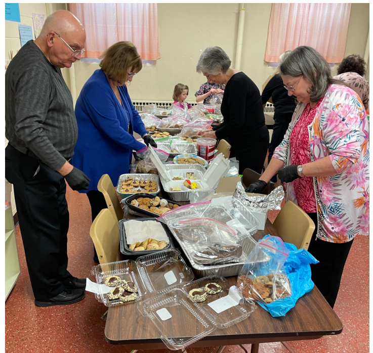
BELOW: The cookie packing crew following worship on Sunday, December 10.