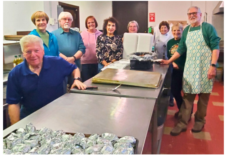
ABOVE: The Community Dinners serving crew on Wednesday, December 13.